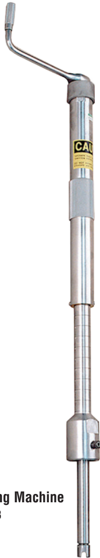
■ T-101 Drilling Machine Model T-101B